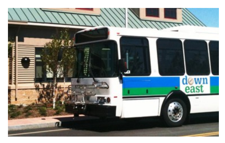
Downeast Transportation is one of several commuter bus service providers in Eastern Maine, providing an alternative transportation option for Hancock County residents who work in the neighboring city of Bangor.

In the four counties that the Eastern Maine Development Corporation (EMDC) serves, most residents live in rural and sparsely populated areas. Public transportation is very limited throughout the region and most people live outside of walking distance of their place of employment. The largest metropolitan area, Bangor, serves as the greatest location of employment for the residents of Eastern Maine, most of whom commute by car. A growing elderly population, a steady number of