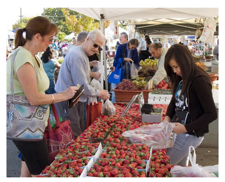
Many residents of Sacramento take advantage of the growing number of farmers' markets available, including this one on the Country Club Plaza Mall.

This has been especially challenging for the Sacramento, California region, which is considered to have the fourth largest agricultural economy in the world. While most of the 2.3 million residents of the region live in urban communities, 70 percent of the landscape is rural agriculture,