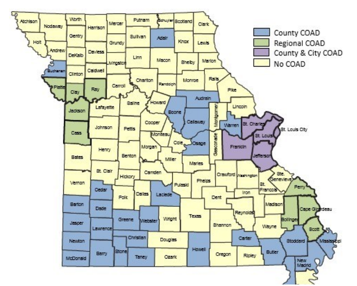
Figure 3: Community Organizations Active in Disaster (COADs) Areas

place at the state and local level, and that homeland security grant funds are disbursed in a coordinated and efficient manner. Both SEMA and OHS partner with the federal government through FEMA's Region VII headquarters in Kansas City.