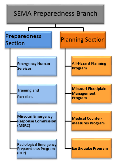
Figure 5: SEMA Preparedness Branch Functions

Because individual citizens and communities must also be ready to act, SEMA promotes personal responsibility through programs such as " Storm Aware ," which offers information and tools to help prepare for, react to and recover from all types of storms. University of Missouri Extension offers preparedness educational programs such as the Community Emergency Management Program (CEMP) to individuals and families, local government, and the private sector. FEMA also offers an emergency preparedness curriculum for individuals through its Community Emergency Response Teams (CERTs) . Currently, Missouri has 84 CERT programs, which offer classes and training